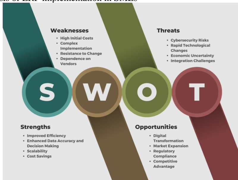
Figure 2 SWOT Analysis

In implementing a new technology in an organization, a SWOT analysis needs to be carried out. SWOT analysis is a versatile tool that can be applied in a variety of contexts to improve decision making and strategic planning. It provides a structured approach to analyzing the internal and external environments that impact an organization or project. The following is a SWOT analysis of ERP implementation in SMEs